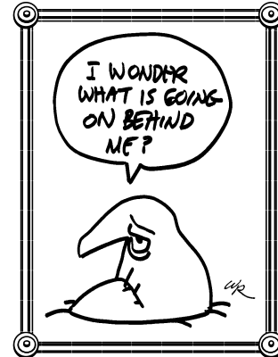
Illo by Rotsler

See Bruce Pelz (in person or at bep@socal.rr.com) for rules and to sign up.