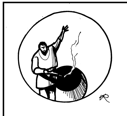
Small Rotsler Gallery